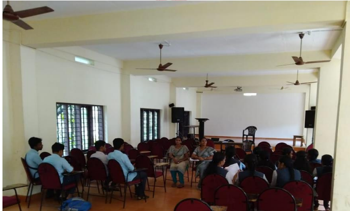
Red Cross Meeting